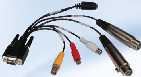
Input Breakout Cable